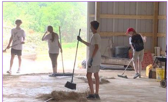
FROM WORK TO FUN