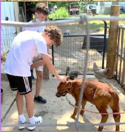
THE MISSION TRIP