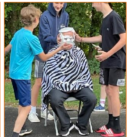
Pie in the Face