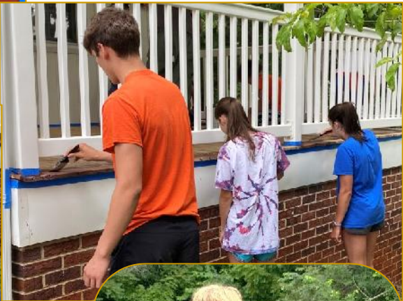
Adding Outdoor Carpet Sanding, Scraping and Painting Cleaning Out Shrubberty