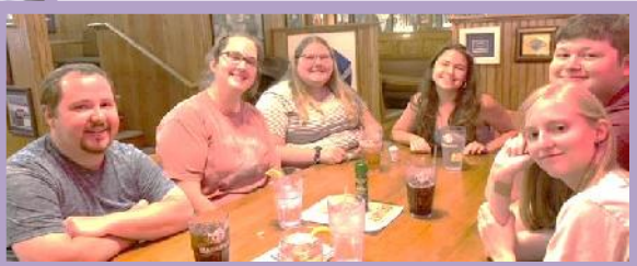
Young Adult Retreat – Enjoying a time of fellowship and relaxation