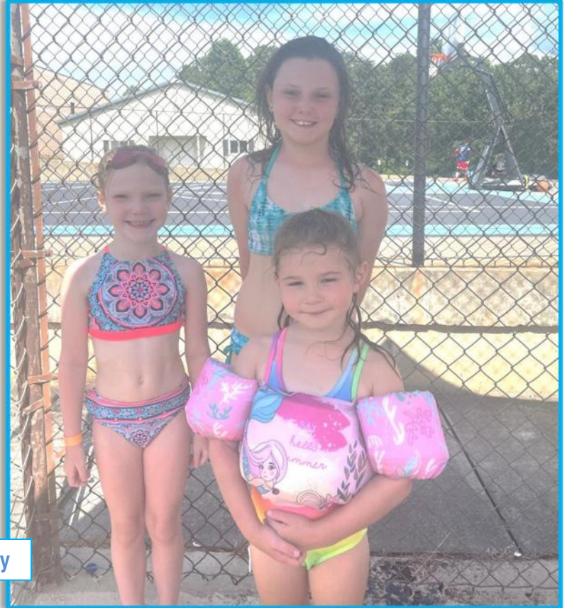
Fun at the Pool Party