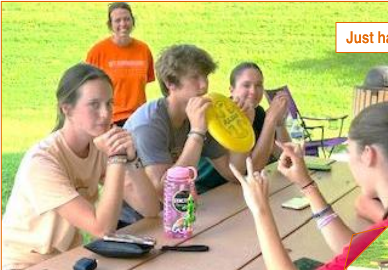
Just hanging out