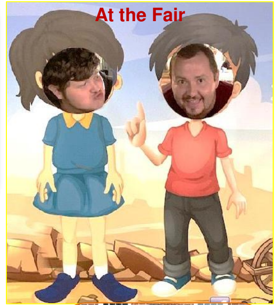
At the Fair