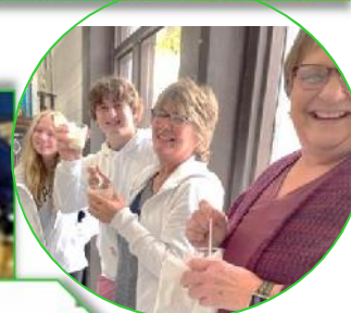
Enjoying Ice Cream