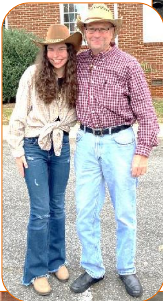
Going West Looking for Parking