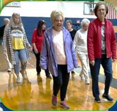
Enjoying the Exercise