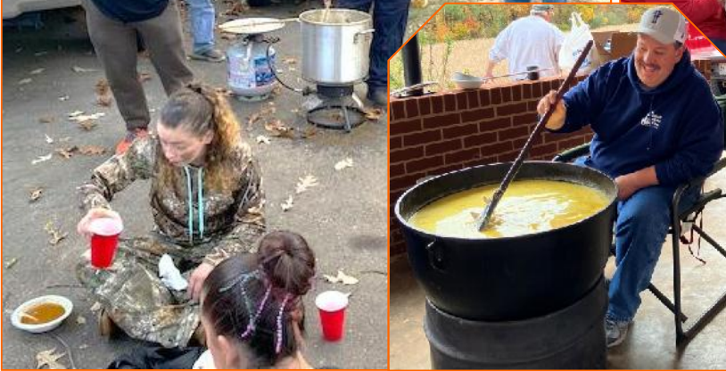
Outside Food & Inside Fun