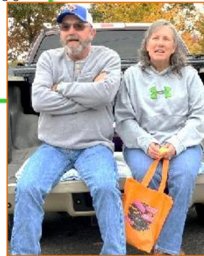
Adam & Eve with Apples