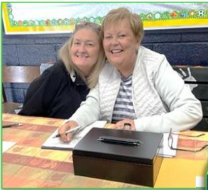
Taking the Money $