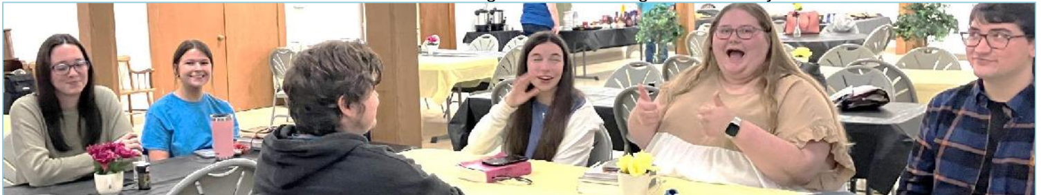
Fun & Food at the Youth and Young Adults Gathering after Saturday's Revival