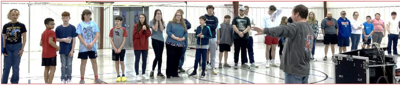
FCNC Young Friends met At Union Cross Friends. February 19 Good fellowship, lesson on Prodigal Son