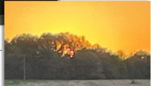
As The Sun Rises . . .

Good Friday Service Worship, Soft Piano and Silent / Open Worship