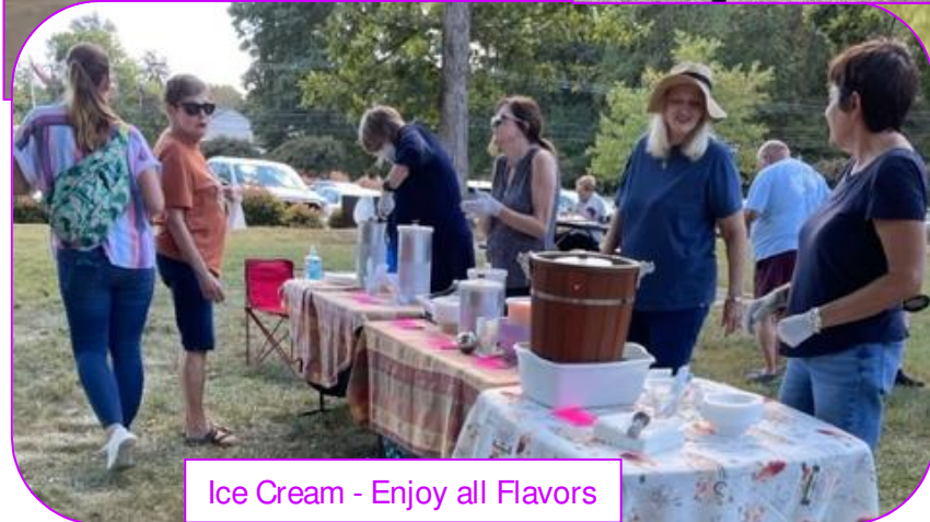
Ice Cream - Enjoy all Flavors