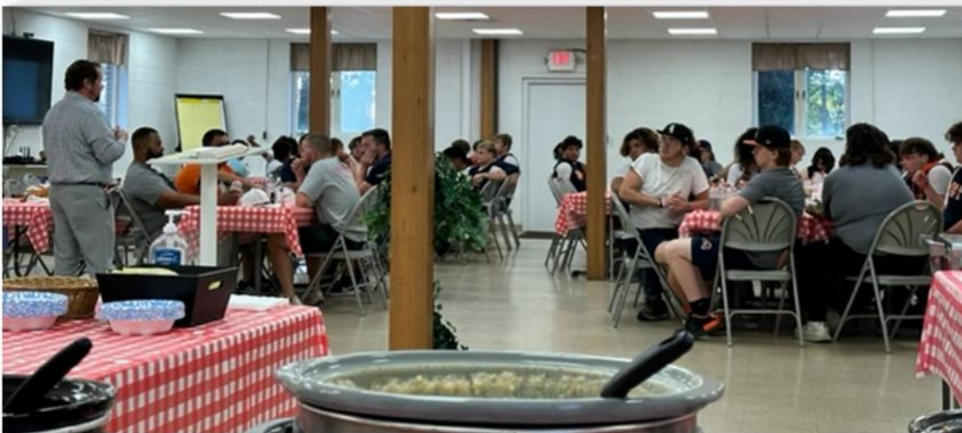
Starmount Rams Some Helpers: