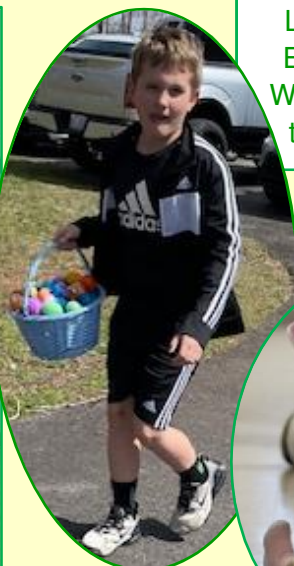
Lots of Eggs & What's in them?