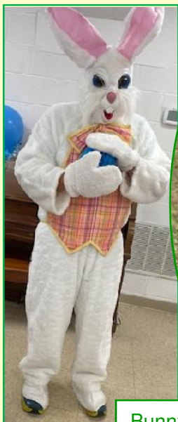
Bunny goes to Egg Hunt

Note: On Sunday, April 28 at 5:00 PM there will be a VBS Training / Information Meeting (See Page 2)