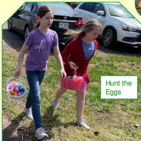
Hunt the Eggs