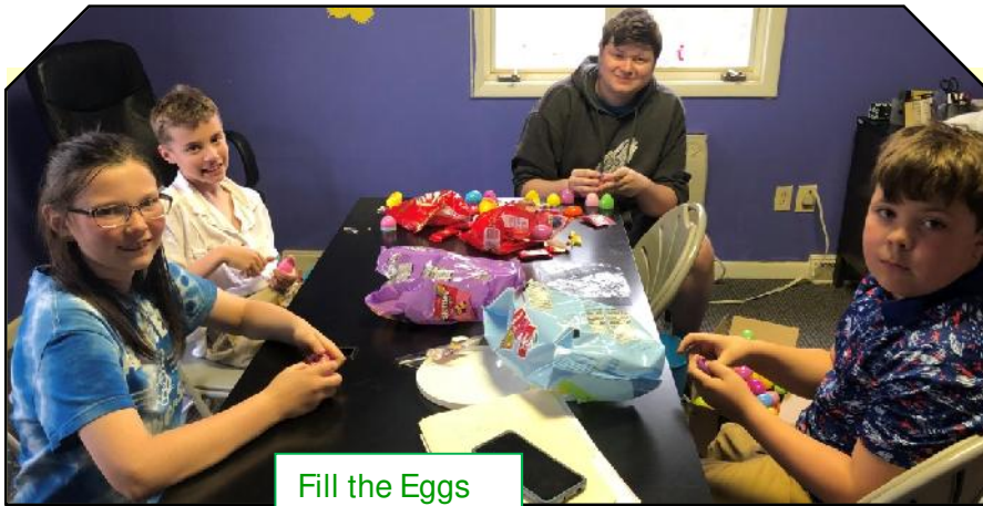
Fill the Eggs

Rules to Live By: The Queries from the Faith and Practice of Friends Church of NC SPIRITUAL GROWTH Are you sensitive and obedient to the leading of the Holy Spirit?