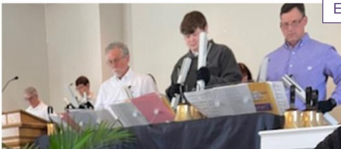
Easter at Deep Creek

They love serving the Lord together and their favorite Bible verse is 2 Corinthians 5:7 "For we walk by faith, not by sight"