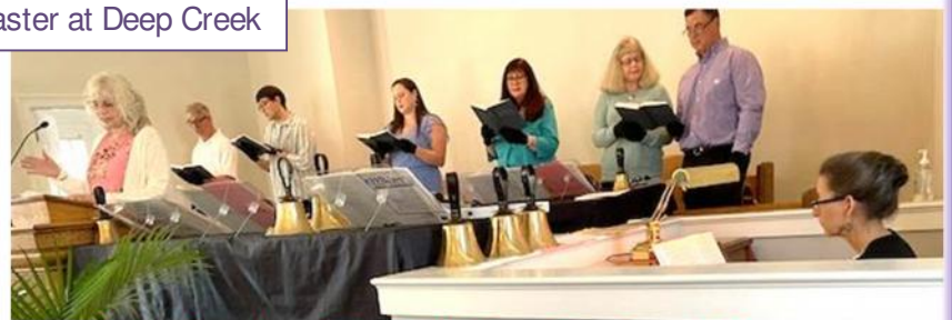
Palm Sunday: The Bells Play; The People Sing