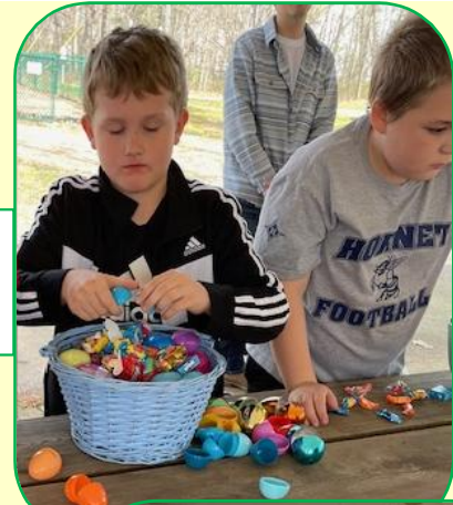
Empty the Eggs