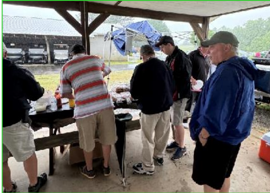
Look at those smiles. Get a bag and enjoy. Try to forget the raindrops falling on your head.