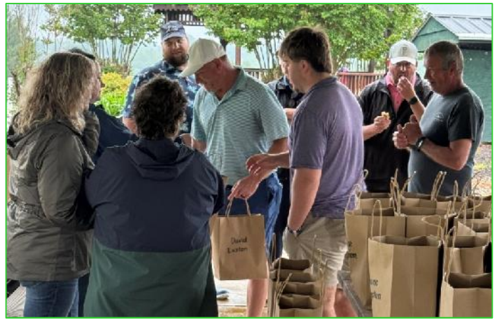
Someone got a prize at the Golf Tournament!

Thanks to everyone for your participation.