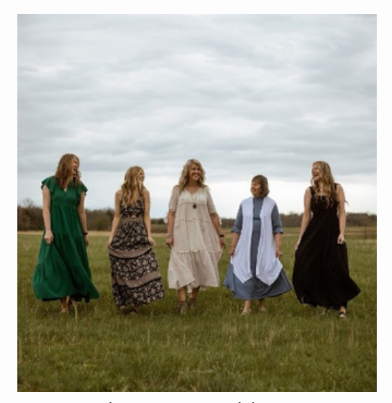
Music by "Anointed by Grace" West Yadkin Baptist Church

Most walkers from a church or organization Largest Dollar Amount raised by a church or organization Random drawing for (2) $25 gift cards